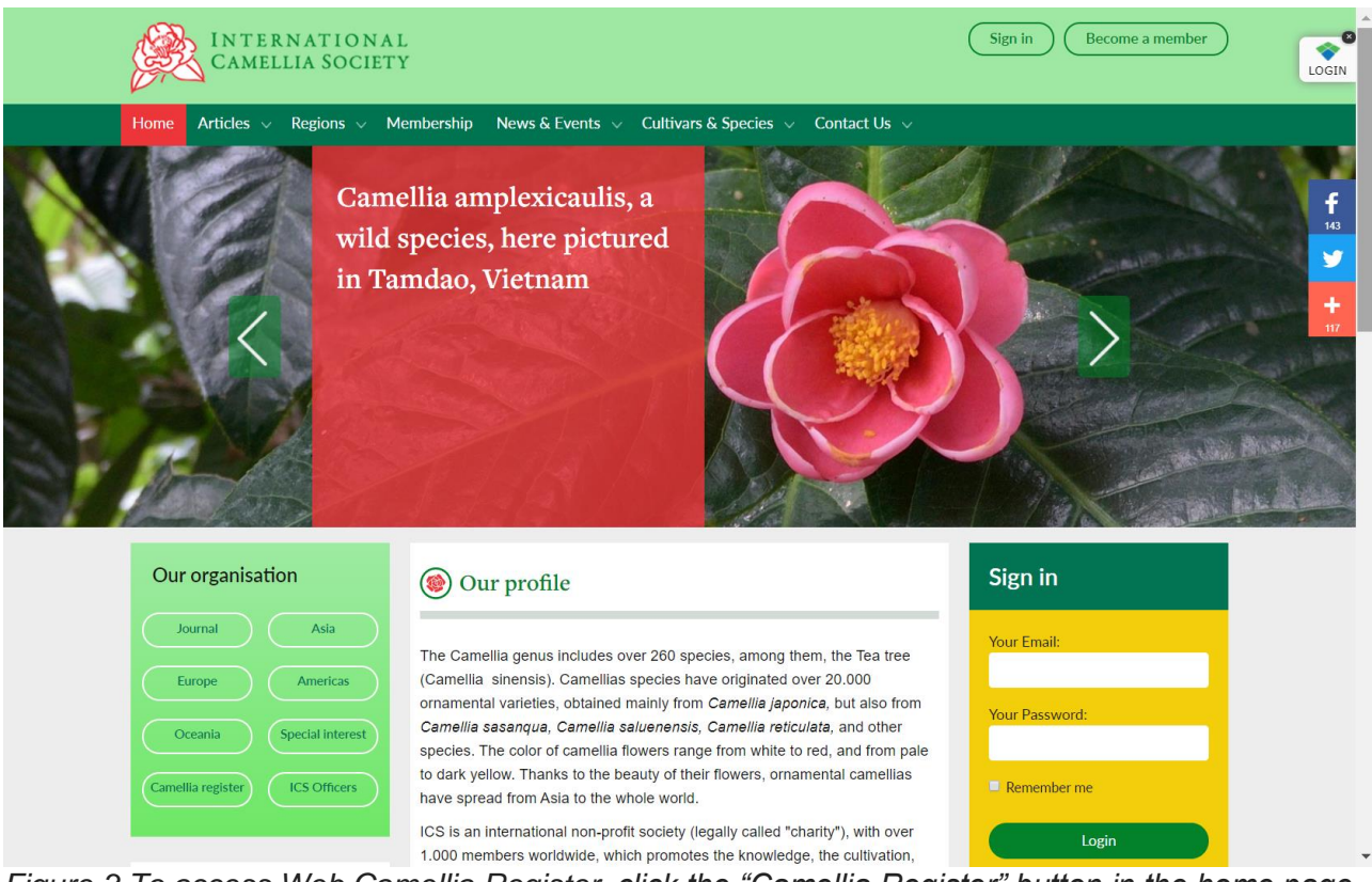
Figure 3 To access Web Camellia Register, click the "Camellia Register" button in the home page.

(Figure 4). The combination "Description only" and "All terms" is useful with cultivars you are not sure about. Since some cultivars are popular, I uploaded multiple pictures of the same cultivar by region, soil, or sport (Figure 5), with captions showing author and location of each picture. Each picture can be magnified by clicking on the top right corner of the illustration (Figure 6). Pictures are always downloadable. Some pictures are copyrighted, e.g. conceded by ACS.