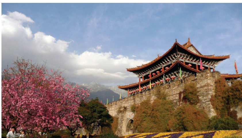
Figure 2: City of Dali

Within and around the city, there are many relics and places of historical interest. It is the political, economic and cultural center Dali region for over 1000 years. The climate is pleasantly spring-like all the year round. The beautiful scenery, varied traditions and the culture of minority nationalities make Dali a well-known tourist destination. Every year, there are around 22 million tourists from home and abroad visit Dali. Camellias and Dali are closely associated with each other. Dali's camellia cultivation goes back to the 8th century. Over centuries, Dali has cultivated a great number of rare camellia cultivars, many of whom are highly reputed among camellia enthusiasts in the world.